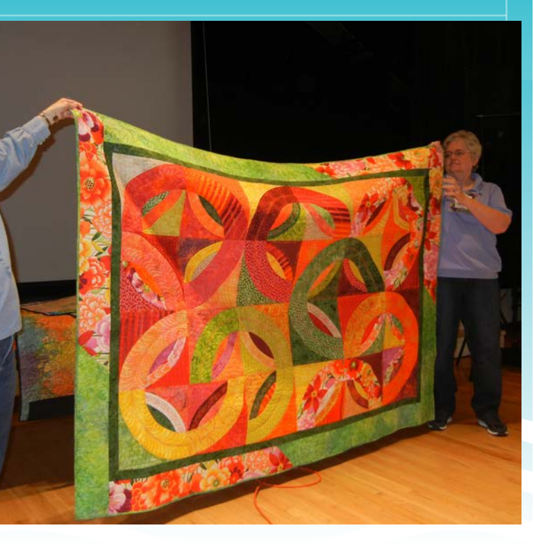
Photo to right is a sample of (cranes) the block that will be used for the 2018 Art in the Redwoods quilt.