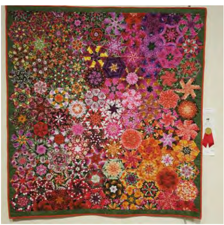
"Daliah" by Sandy Hughes Second Place