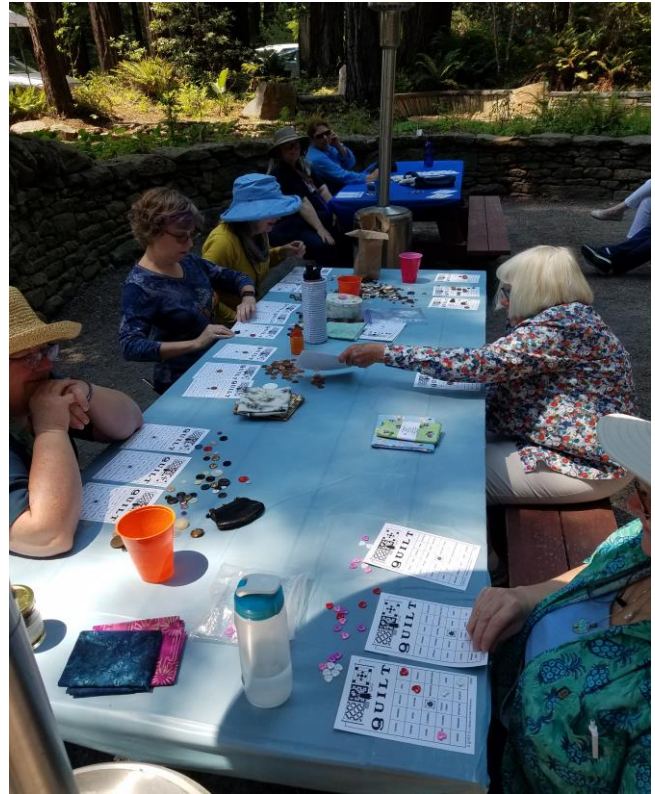
"Serious Quilto players"