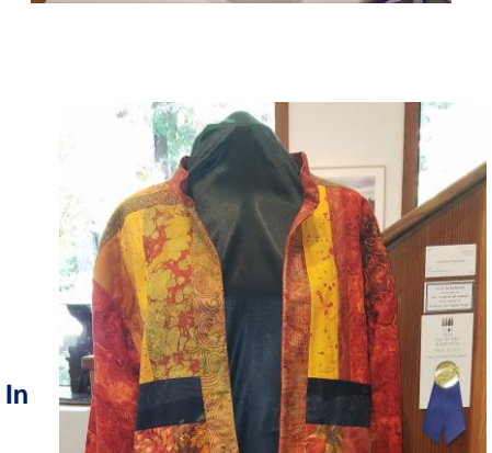
Kalynn Oleson First Place Fibers,Textiles and Soft Sculpture Category

Sandy Hughes Second Place in Quilt Category