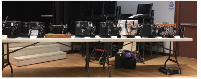
Our guild had 19 Featherweight machines displayed.