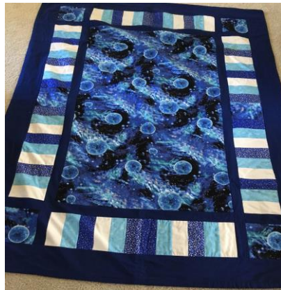
From Della Zita