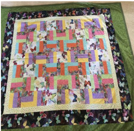
From Della Zita