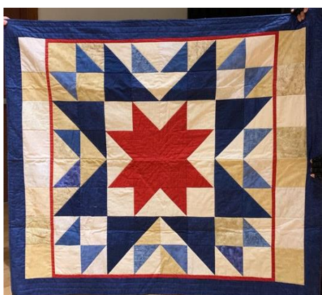
Two Quilts of Valor by Connie Seale