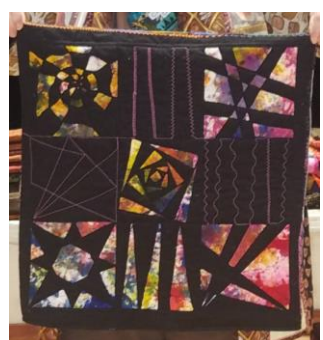
Side 1 of chair cover made by Caroline Ogg

English Paper Pieced potholder made for Festival of Trees.