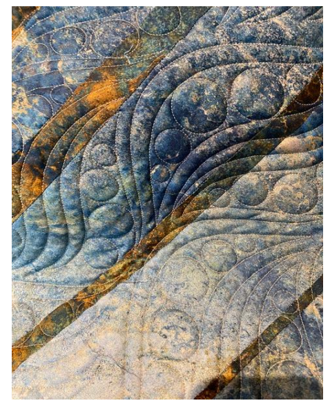
Small sampling of the quilting design