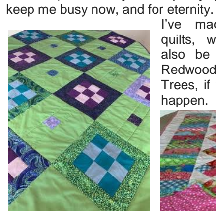
I sure am looking forward to when we can all get together again and have a spectacular show-and-tell.

or eternity. I've made several comfort quilts, which could possibly also be sold at Art in the Redwoods or Festival of Trees, if those events actually