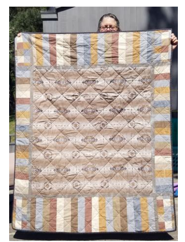
Mary Eberhard: 1. Comfort quilt (southwest colors & ticking back)