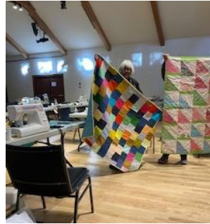
Janice Batchelder Comfort Quilts