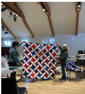
Dee Goodrich Comfort Quilt