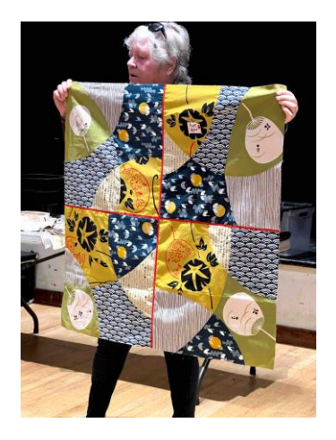
Sylvia Evans – Asian From workshop