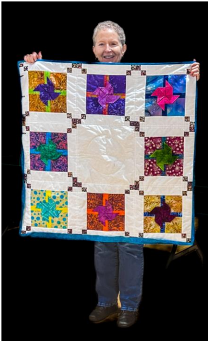
Cheryl – for FOT