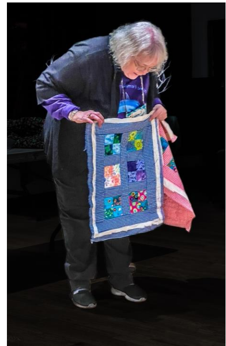
Francie – doll (or dog) quilts