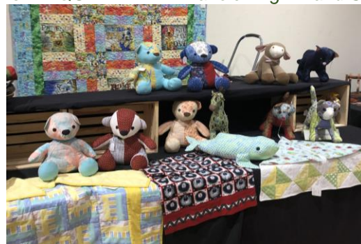
AFTER FOT SALES