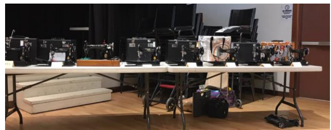
Our guild had 19 Featherweight machines displayed.