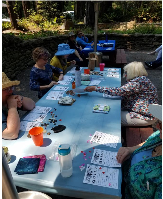
"Serious Quilto players"