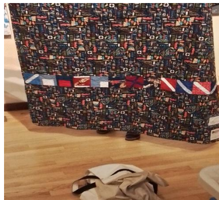
Back of VHQ Quilt made at PPQG Retreat