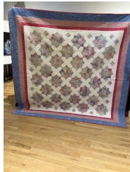
AIR QUILT 2026