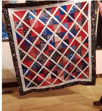
VHQ Quilt made at PPQG Retreat