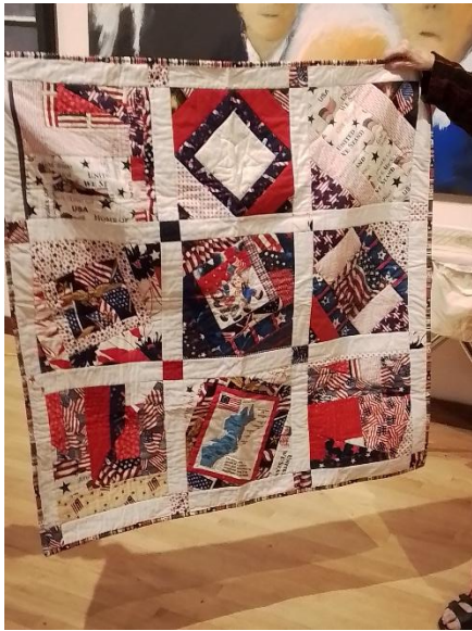
Donation for Veterans Honors Quilts