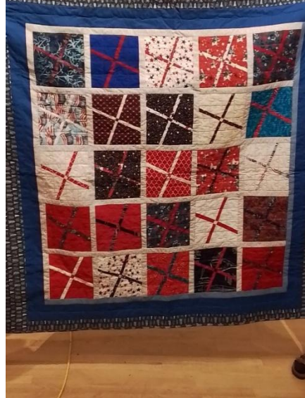
PPQG Retreat Quilt