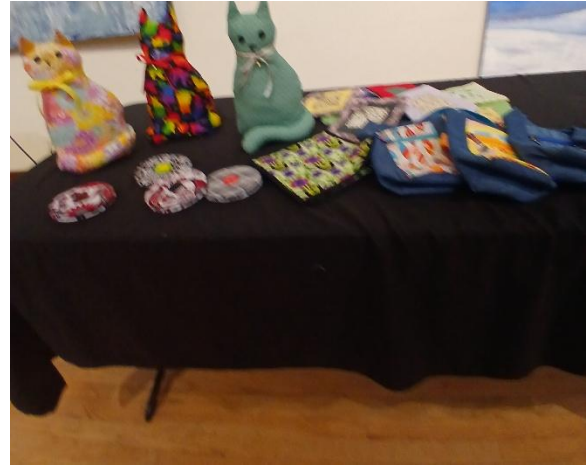
Fundraising Fun May 2026