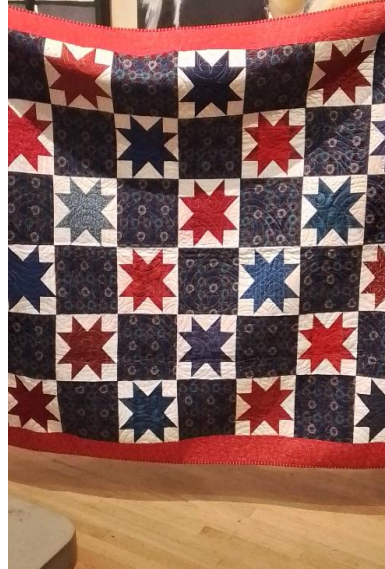
Annie's Star Quilt Guild