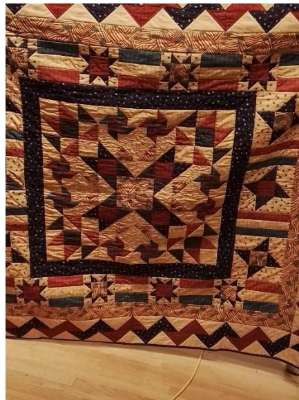
Annie's Star Quilt Guild