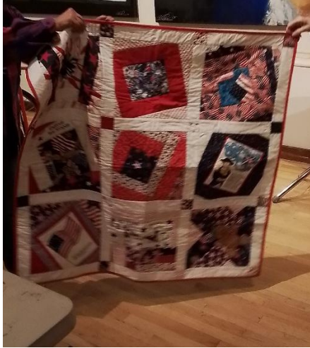
Annie's Star Quilt Guild