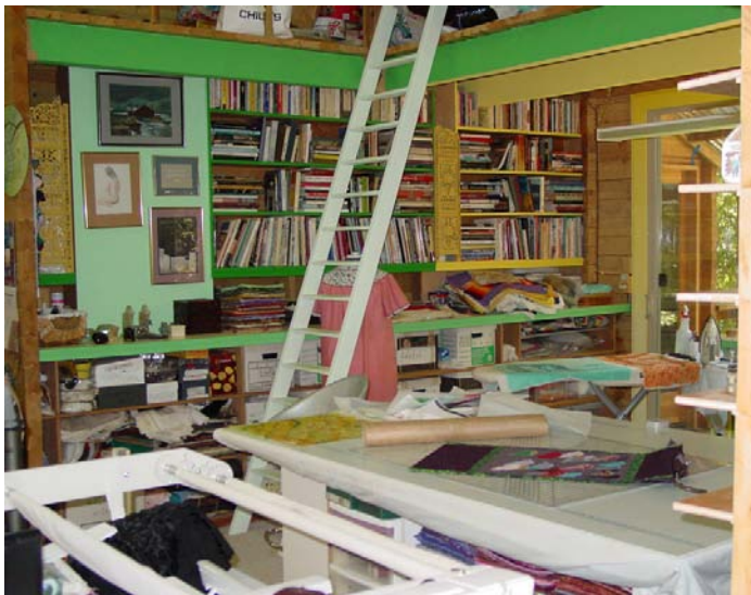
Just a small section of Iris Lorenz-Fife's studio